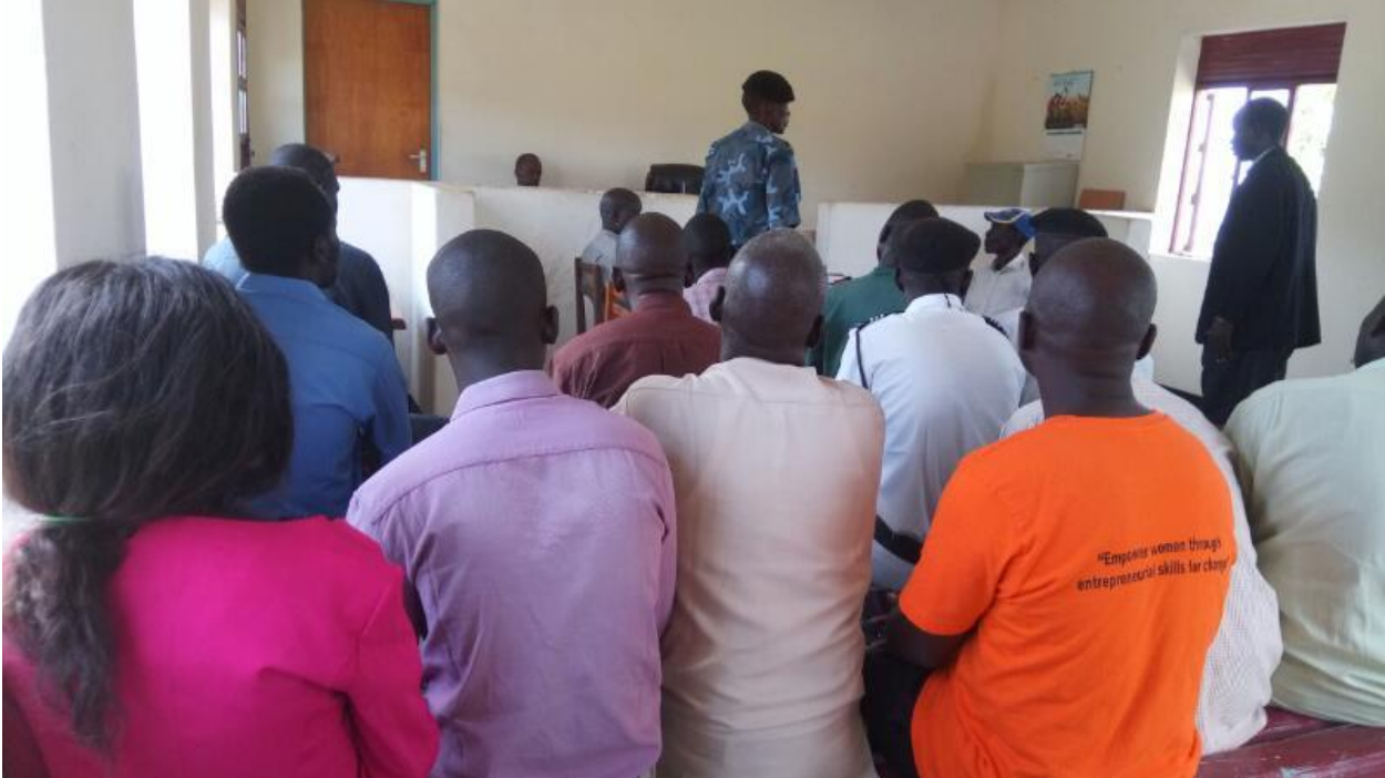
A mobile court session in progress in Nimule Magistrates Court, April 2017

STEARDDWOMEN hosted a mobile court in Nimule from the 3 rd -13 th /04/2017. The court hearings were presided over by the President of the High court of Eastern Equatoria Hon Judge Obac Denyong Anyong and the two Magistrates of Nimule. At the end of the 10 days hearing, four cases were successfully handled (1 rape and three murder) and 11(3 rape and 8 murder) cases were still on going. The police administration in Nimule Payam also decided to open a GBV desk for survivors as a result of the outcome of the mobile court