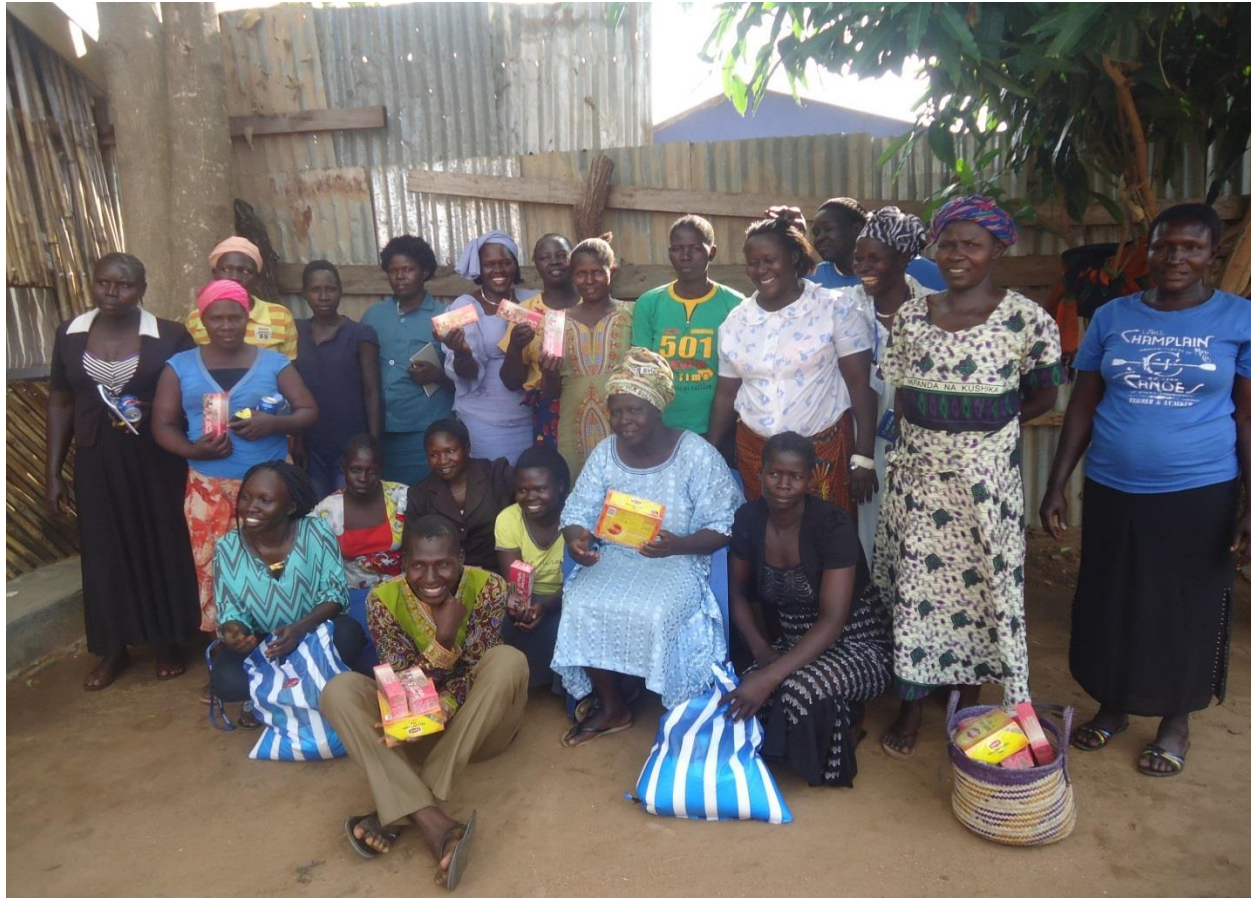
Women coffee vendors in Magwi pose for a group photo with some carrying their in kind support.