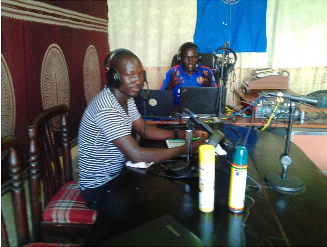
Live radio talk show on GBV prevention on Voice of Freedom F.M in Magwi