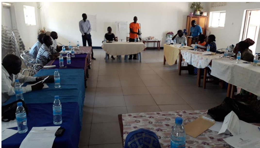
A cross section of the participants during the AGM.