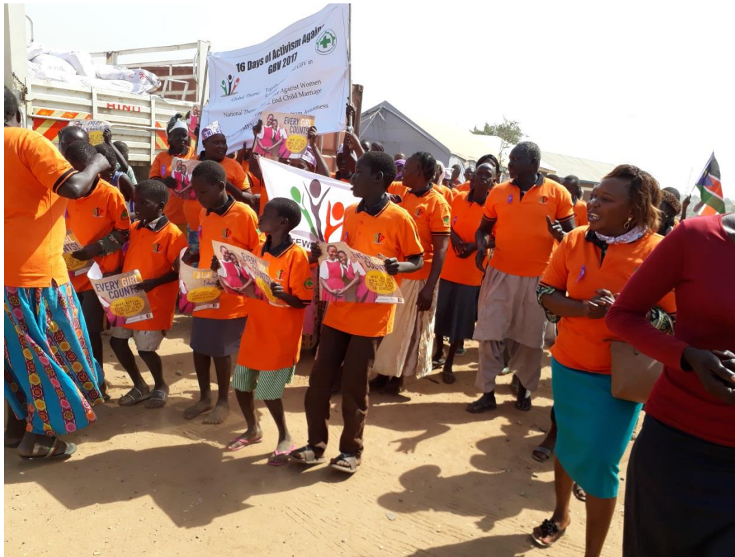
16 Days of activism March in Juba Way Station